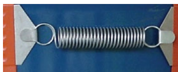
10180: Replacement Spring