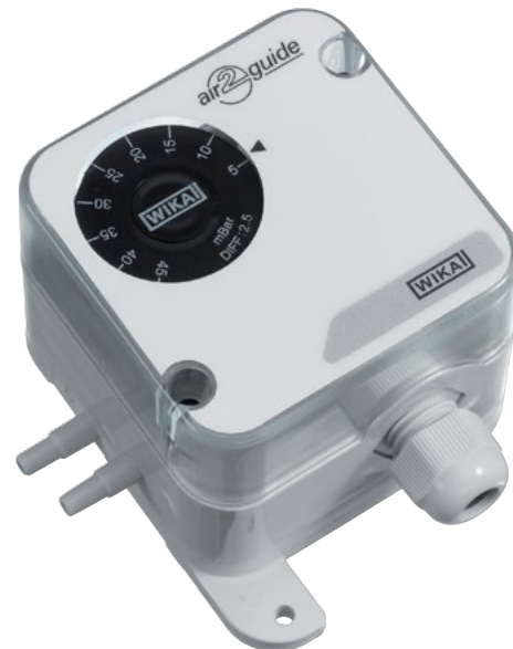
Differential Pressure Switch Type A2G-40