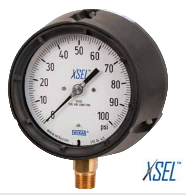
Bourdon Tube Pressure Gauge Model 212.34

Additional error when temperature changes from reference temperature of 68^{\circ}F ( 20^{\circ}C ) \pm0.4\% for every 18^{\circ}F ( 10^{\circ}C ) rising or falling. Percentage of span.