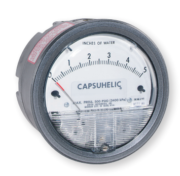
Capsuhelic® pressure gage has a large, easy-to-read 4" (102 mm) dial.