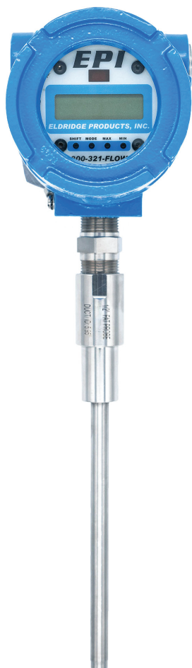
SERIES 9800MP FAT