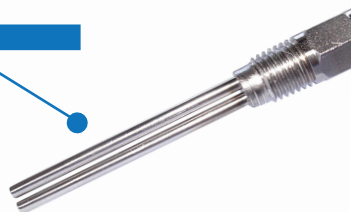
Flow Averaging Tube (FAT)