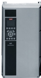
IP 66 / NEMA UL Type 4X