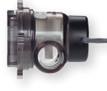
SFI with A-711 option