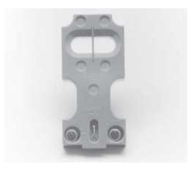
Figure 1. Logic Module