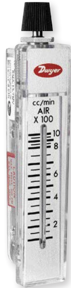
Model RMA-TMV 2" scale, 4-13/16" high